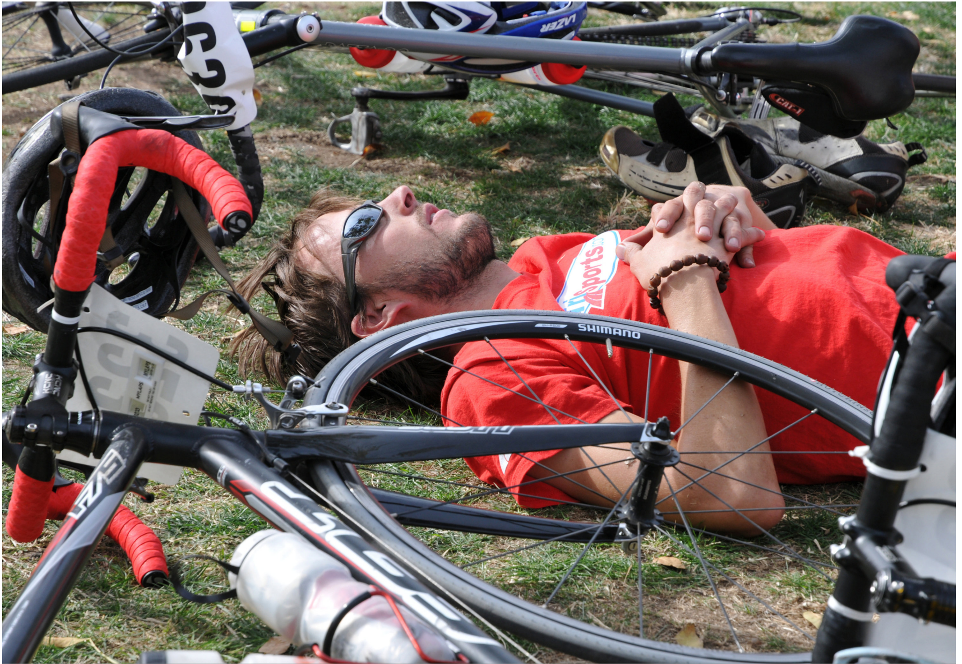
Cooked. Photo © 2011 Martha Retallick. All rights reserved.