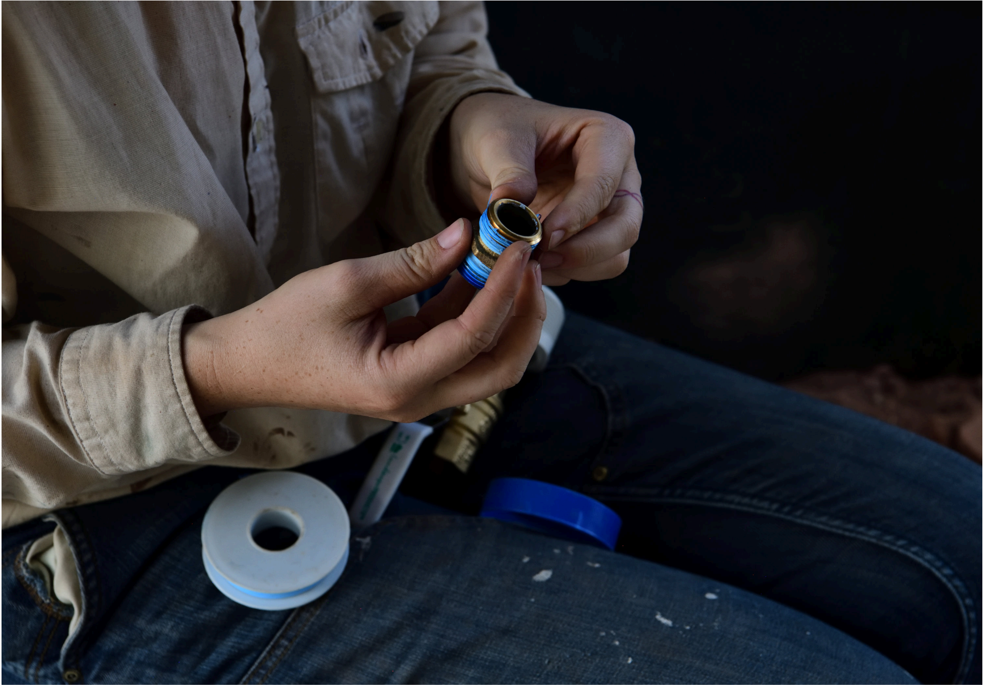
Leak-Proofing Pipe Threads.