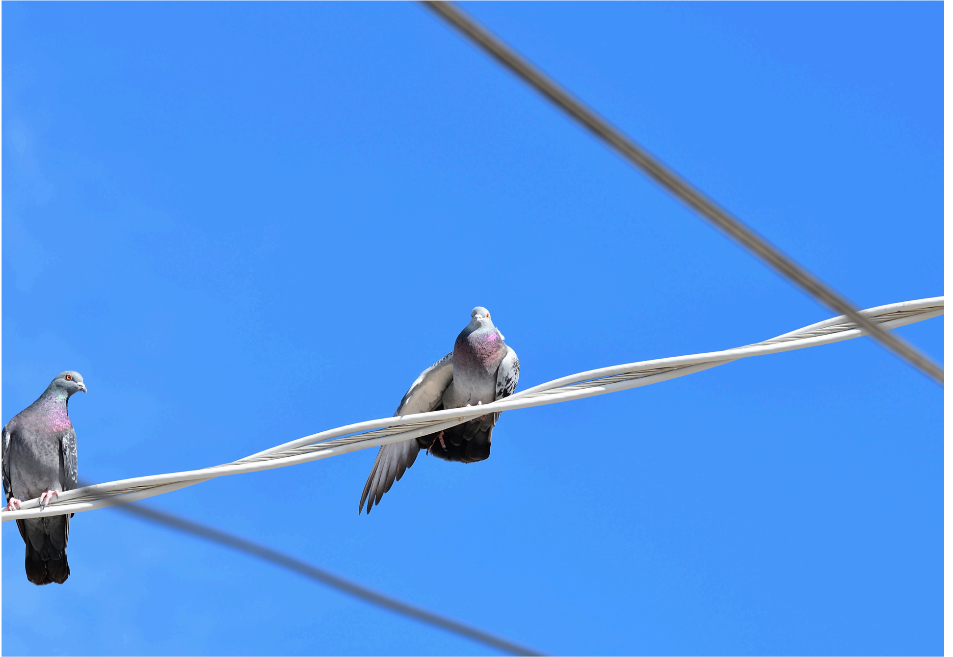
On the Wire.