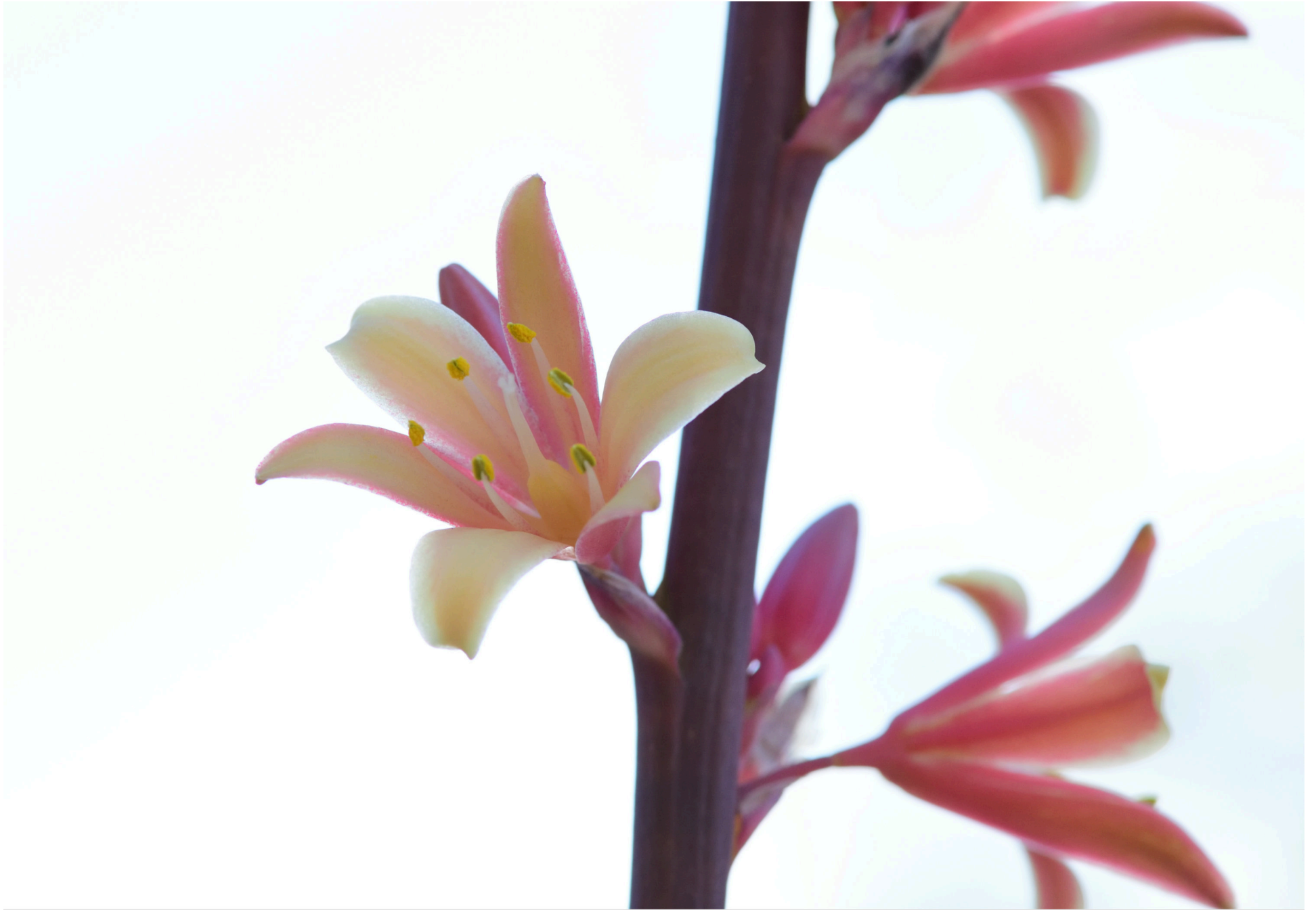
Hesperaloe Flowers.