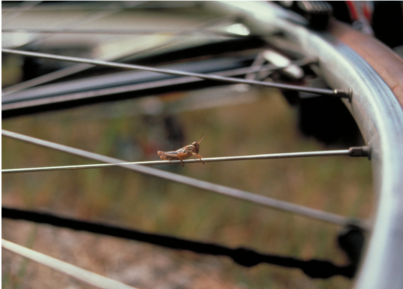
Spokes Hopper. Photo © 1981 Martha Retallick. All rights reserved.