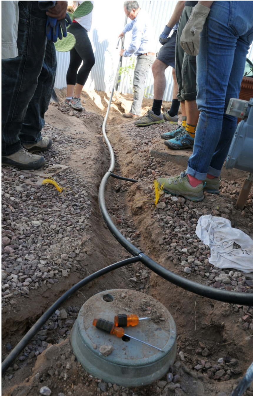
Installing Greywater Lines in My Back Yard.