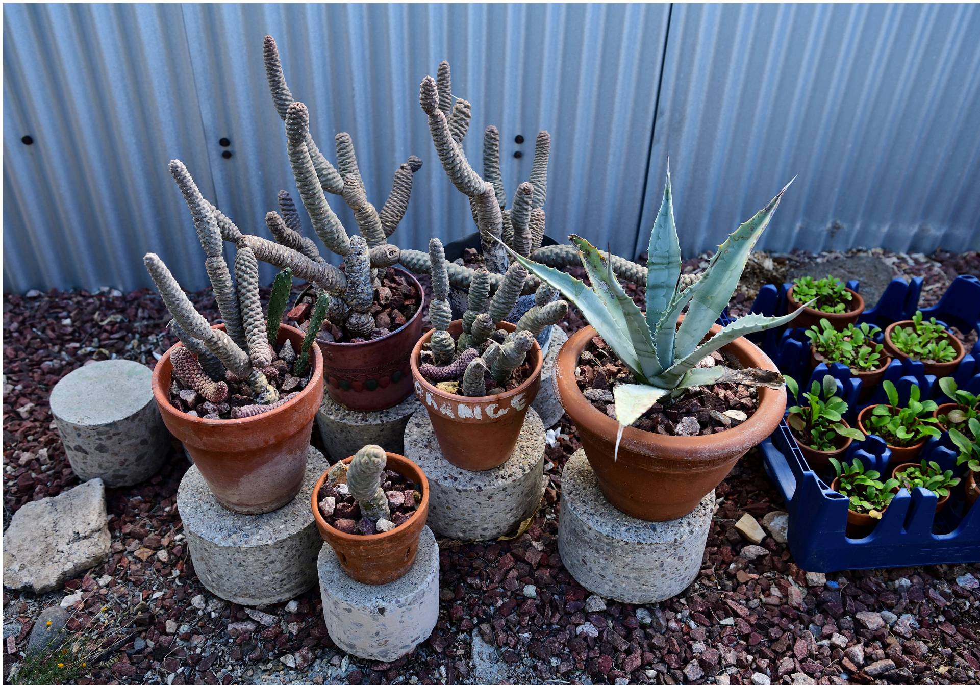
Upcycled Plant Stands.