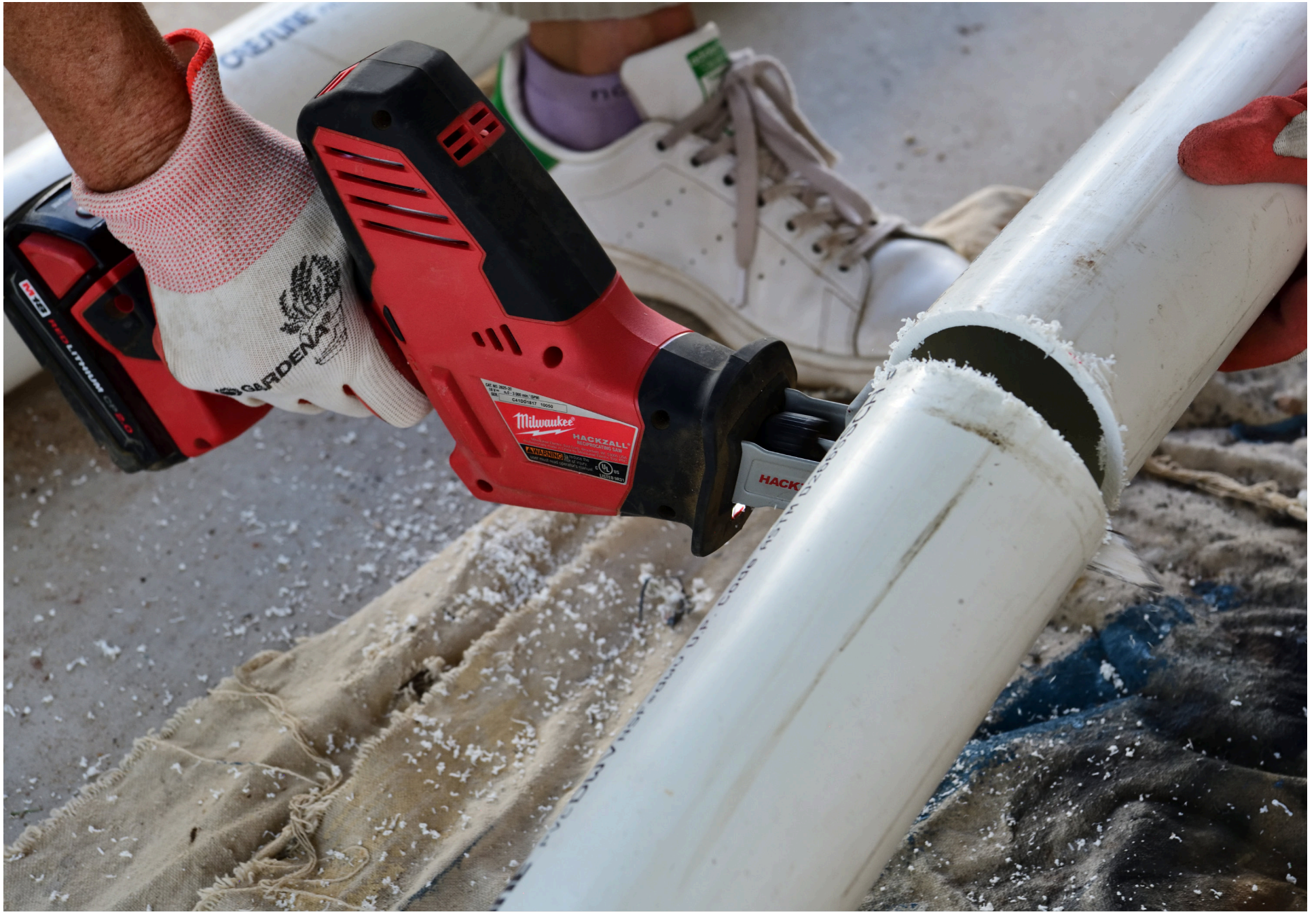
Cutting Cistern Plumbing Pipe.