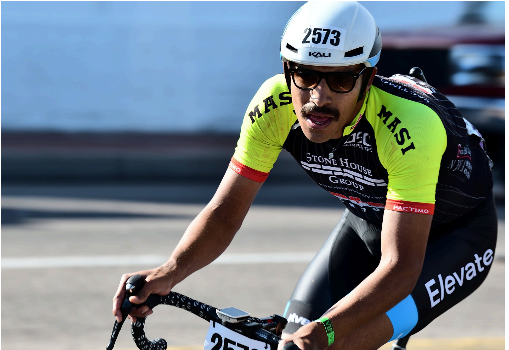
Winner, 2019 Tour de Tucson.