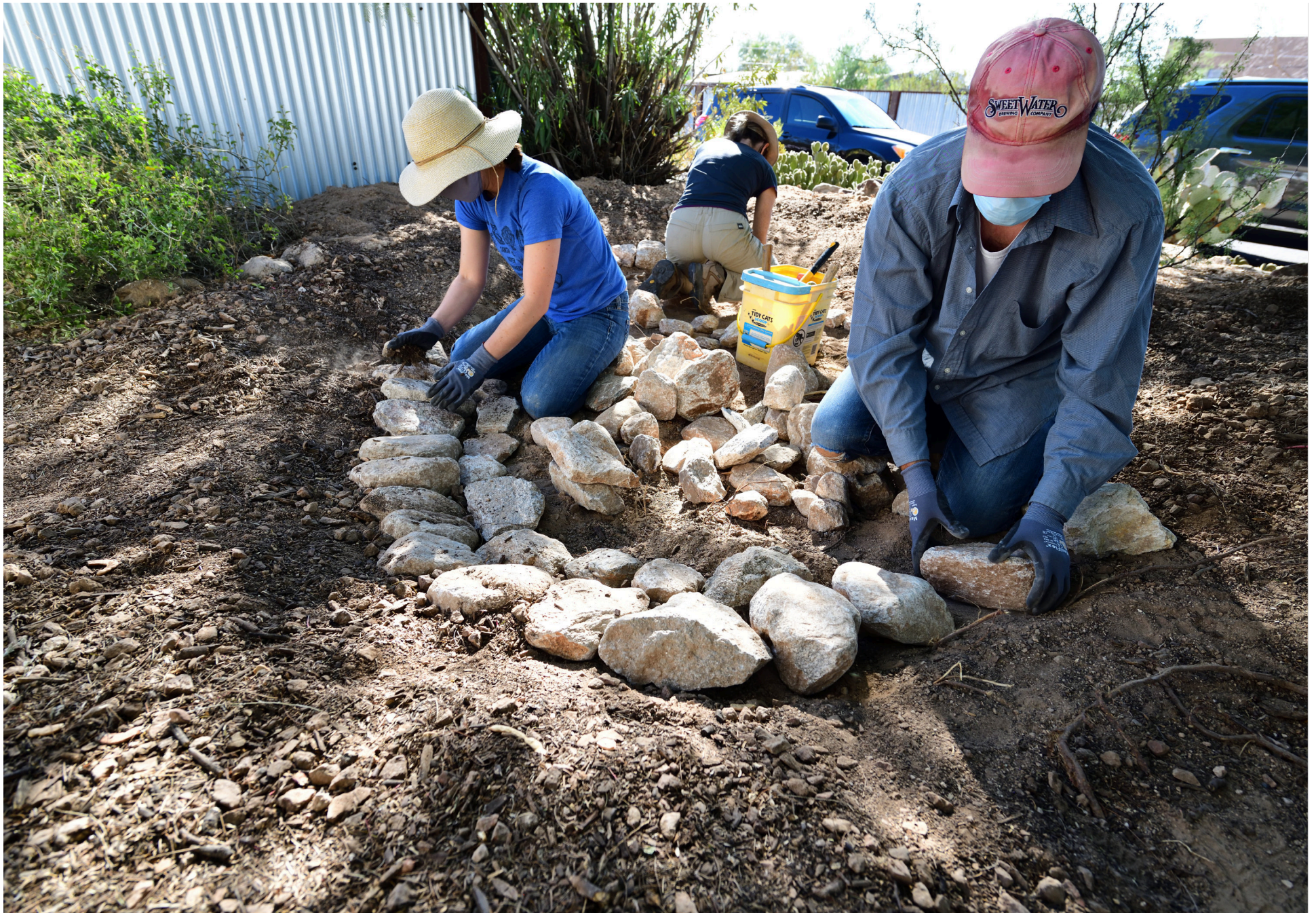
Building Earthworks.