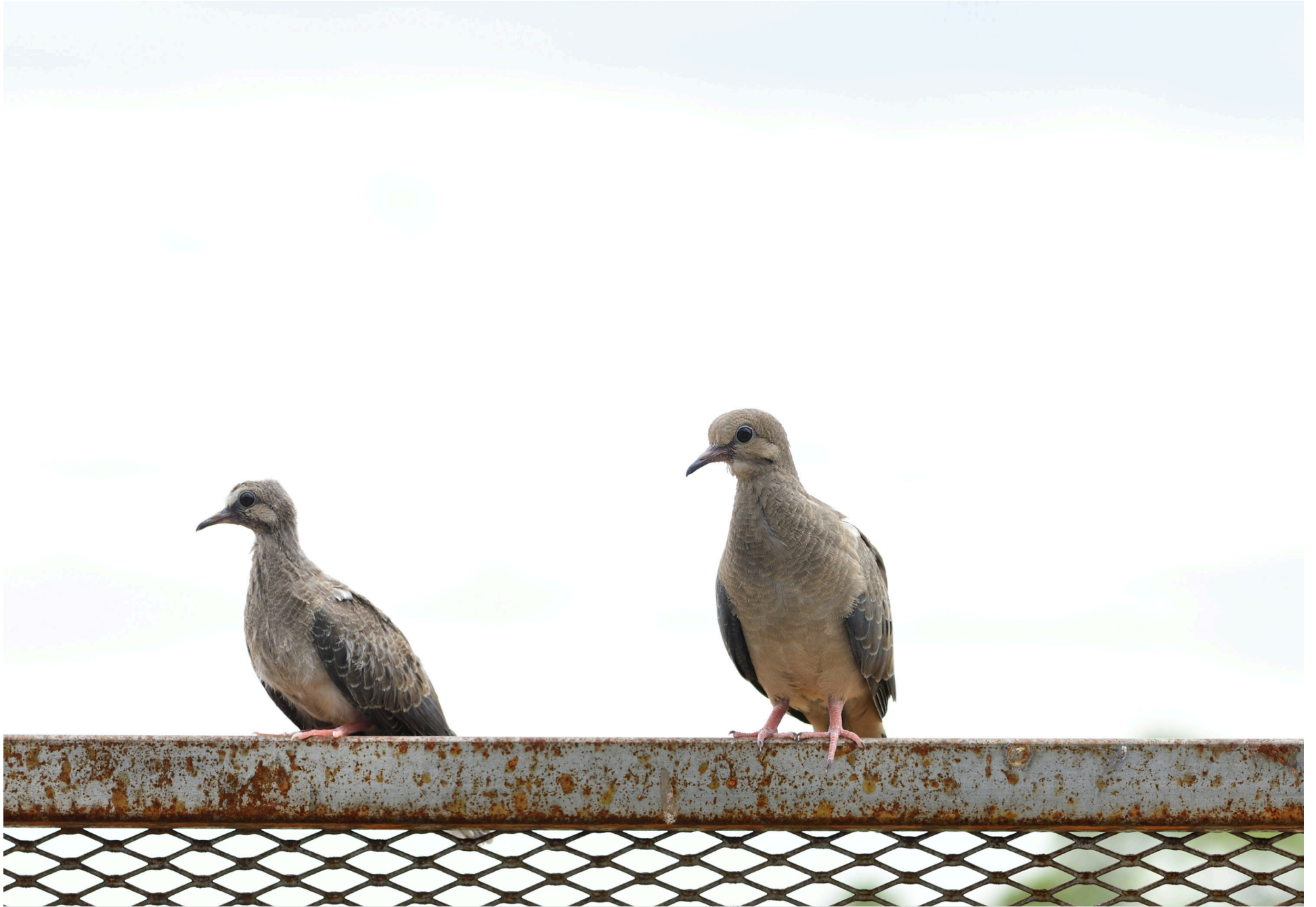
Junior Aviators.