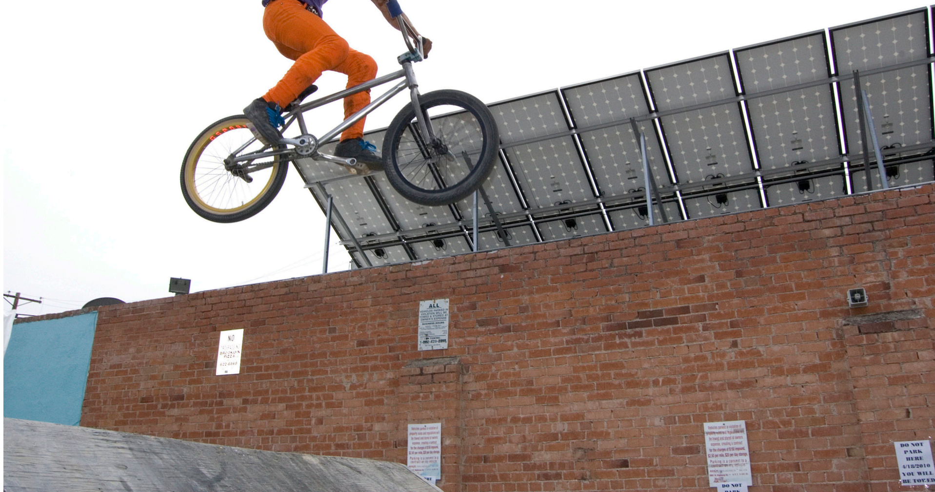
Freestyling. Photo © 2010 Martha Retallick. All rights reserved.