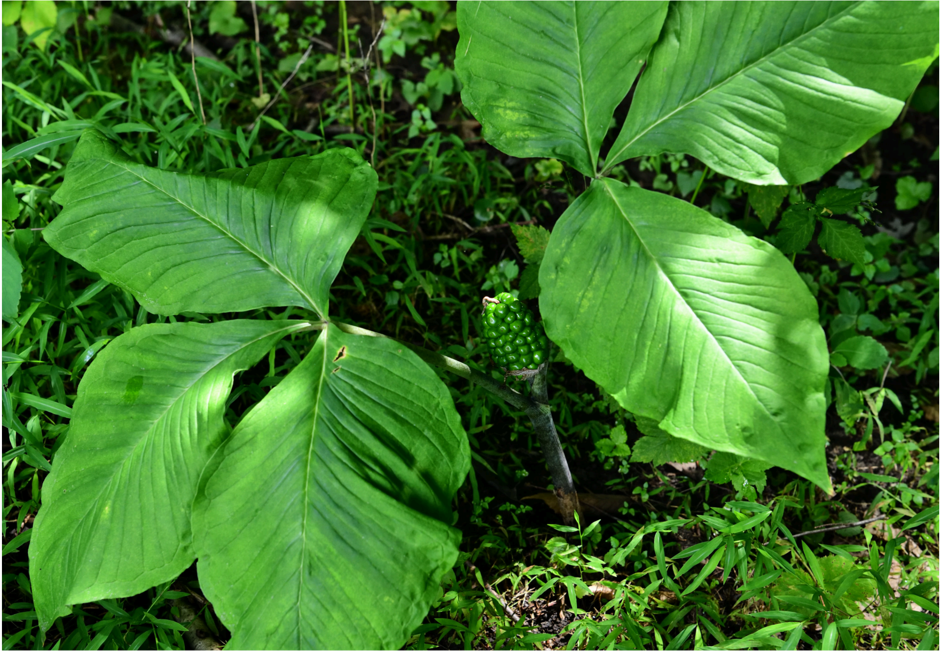
Jack in the Pulpit.