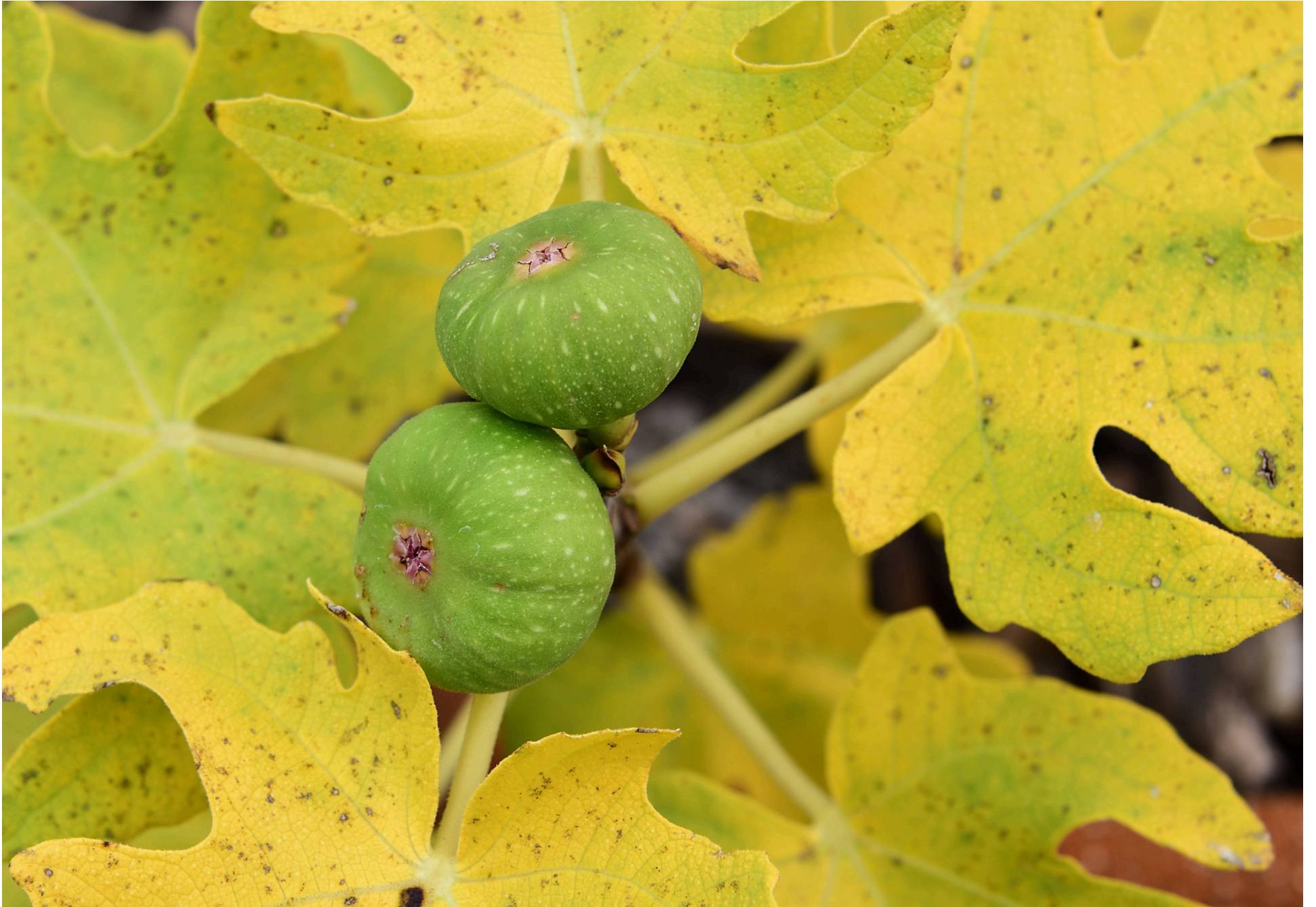
Autumn Figs.