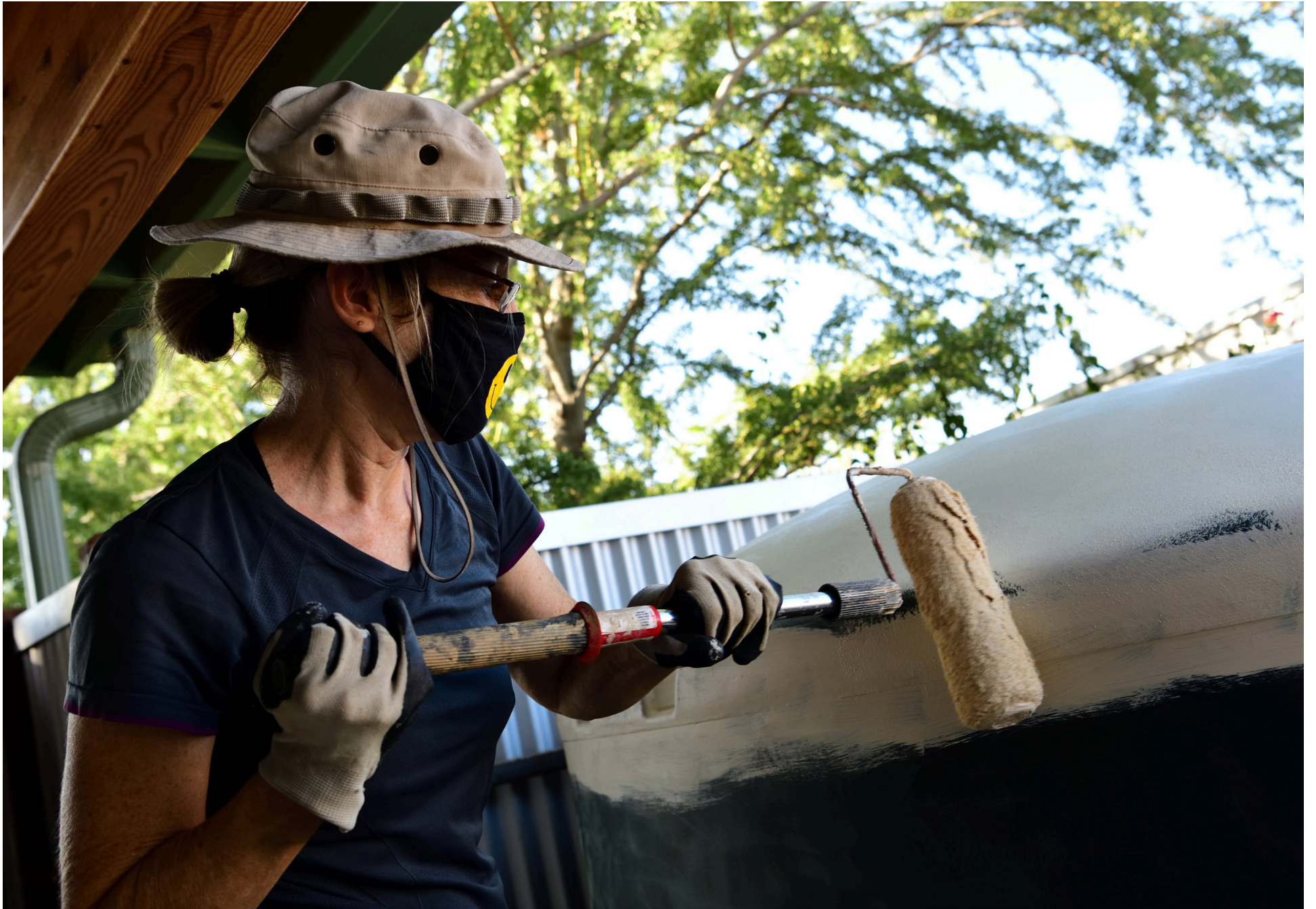
Priming Cistern.