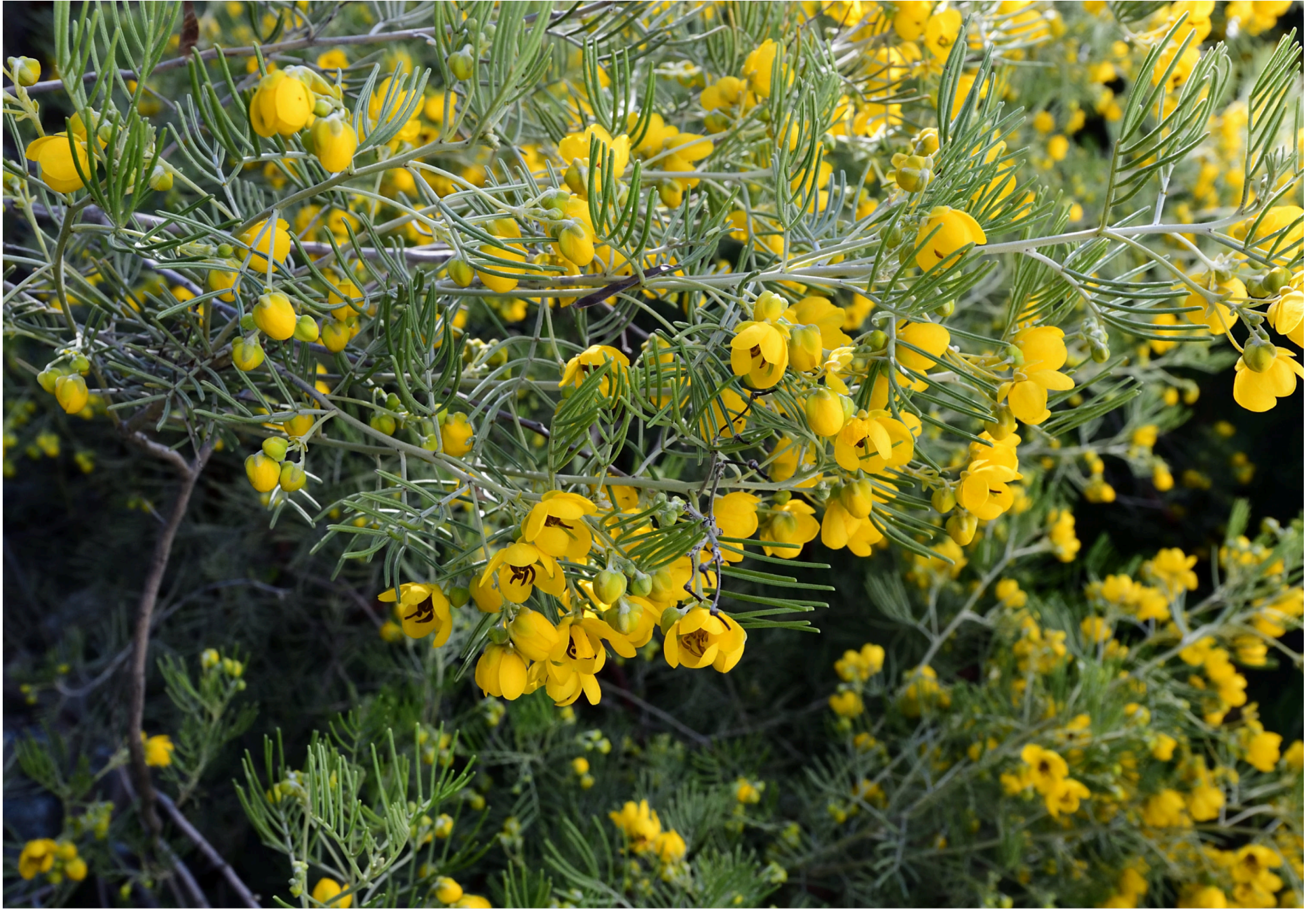
Feathery Senna Flowers.