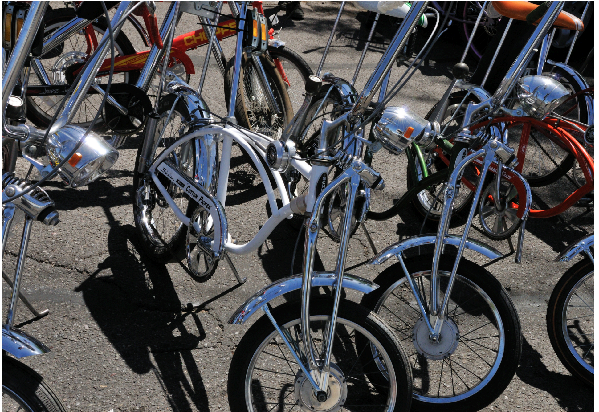
Classic Bike Exhibit. Photo © 2011 Martha Retallick. All rights reserved.