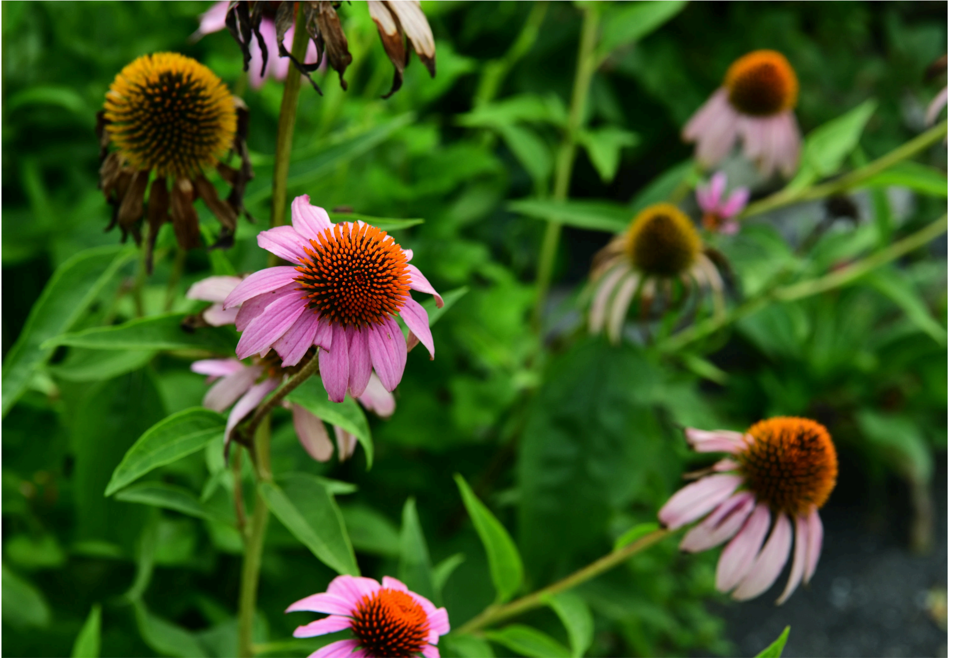
Purple Coneflowers.