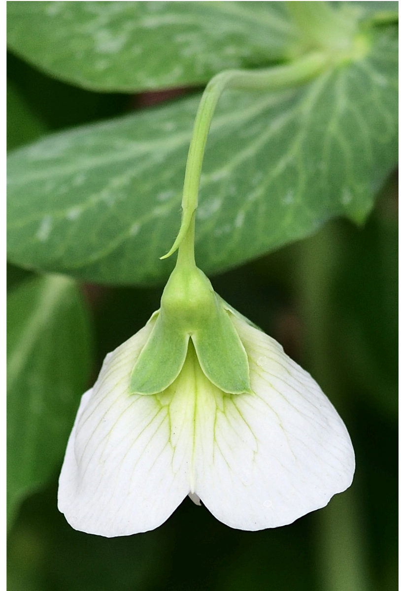
Snow Pea Flower.