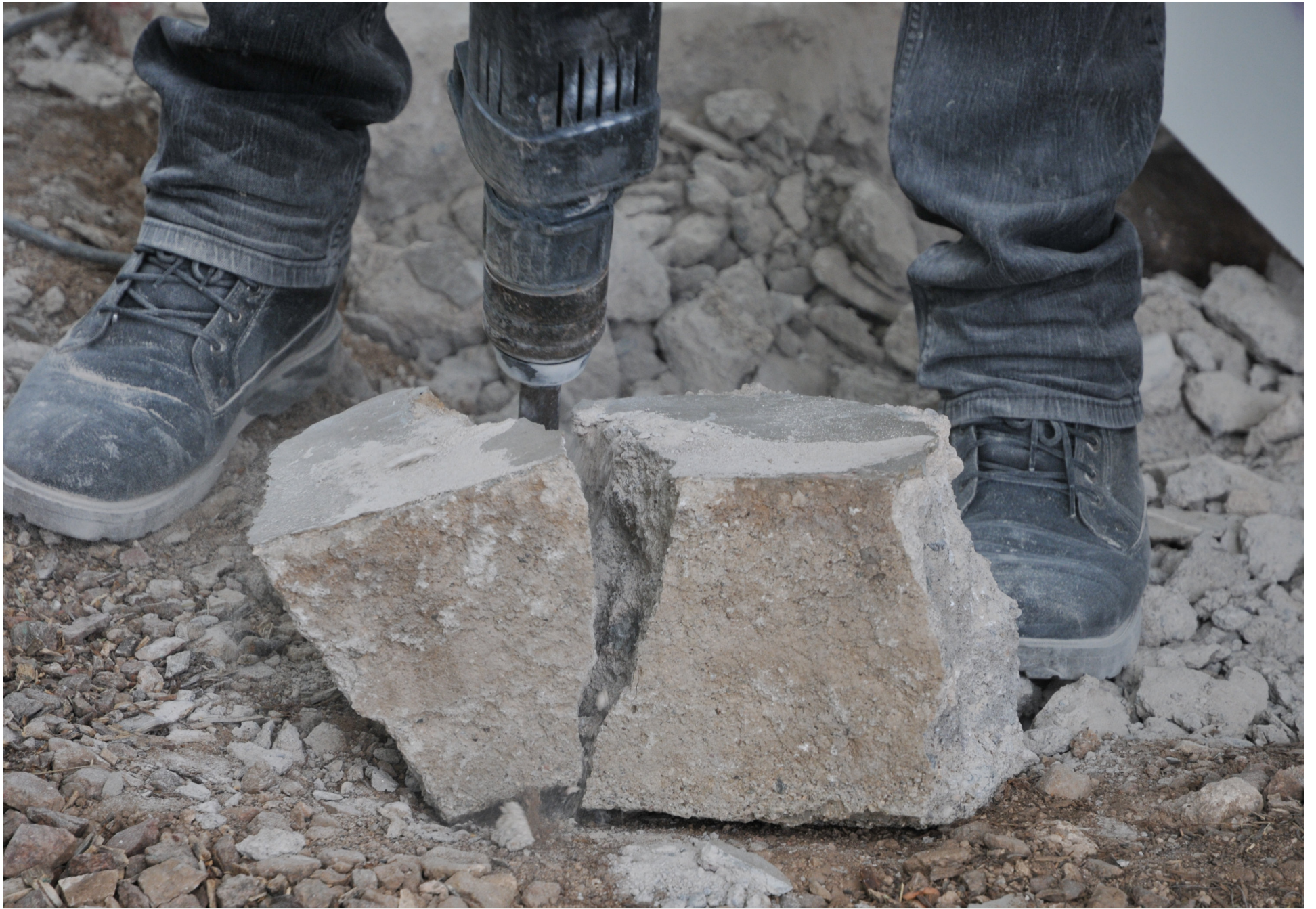
Removing Old Front Walk.