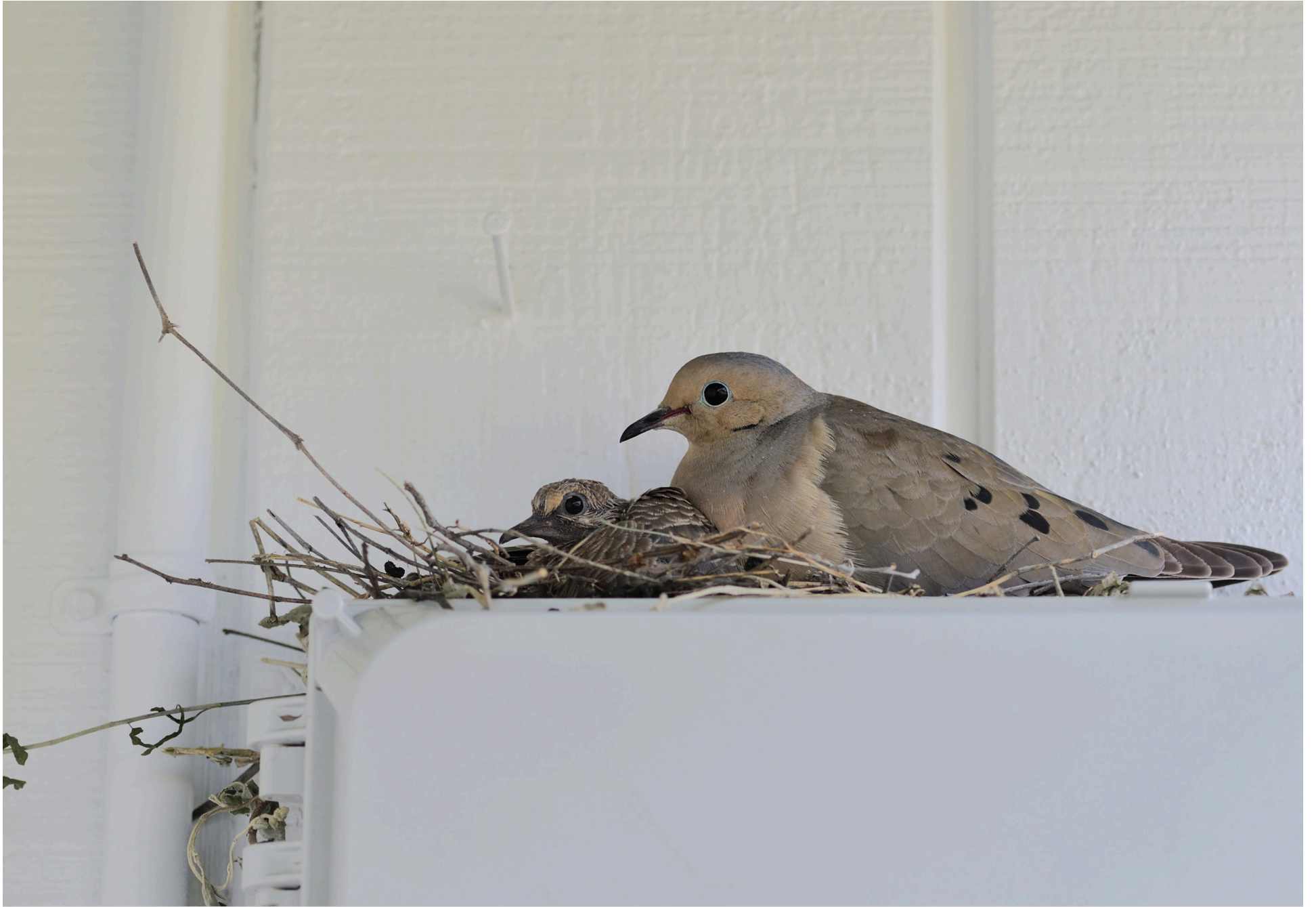
Mourning Doves.