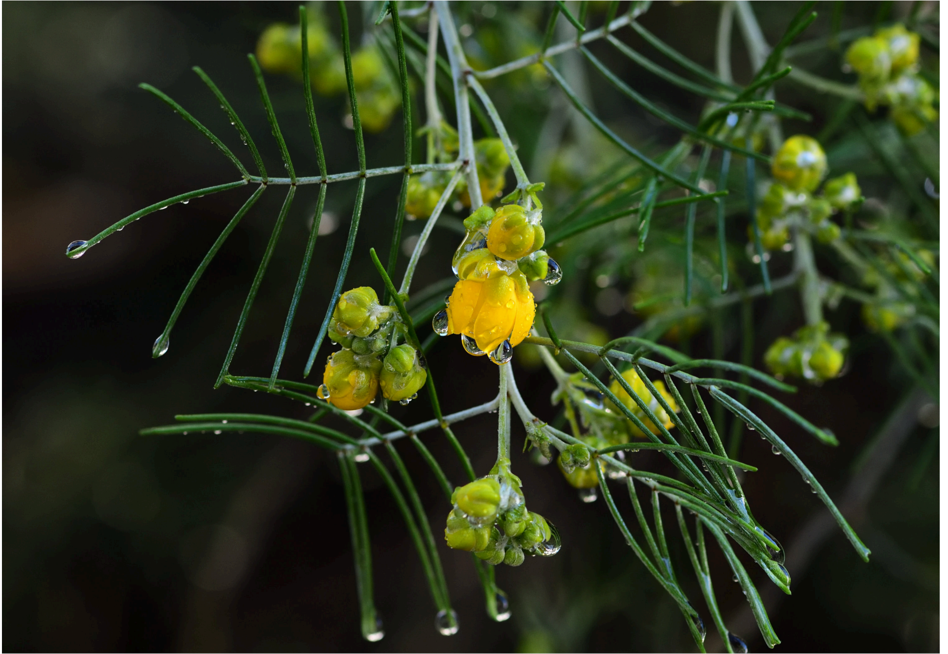
Feathery Senna Blossoms. Photo © 2019 Martha Retallick. All rights reserved.