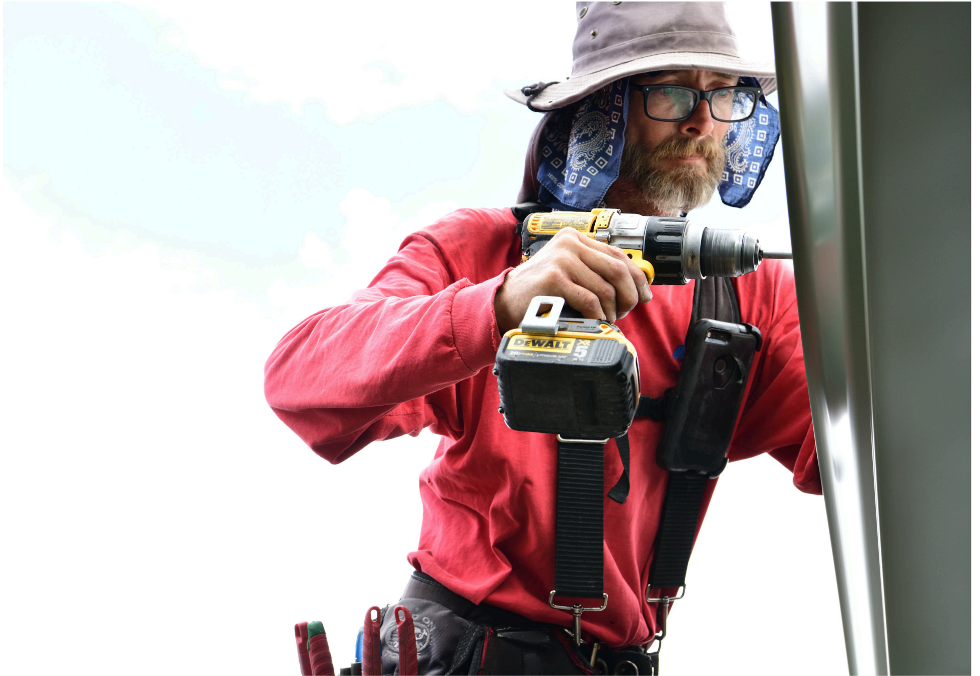
Rain Gutter Installation. Photo © 2020 Martha Retallick. All rights reserved.