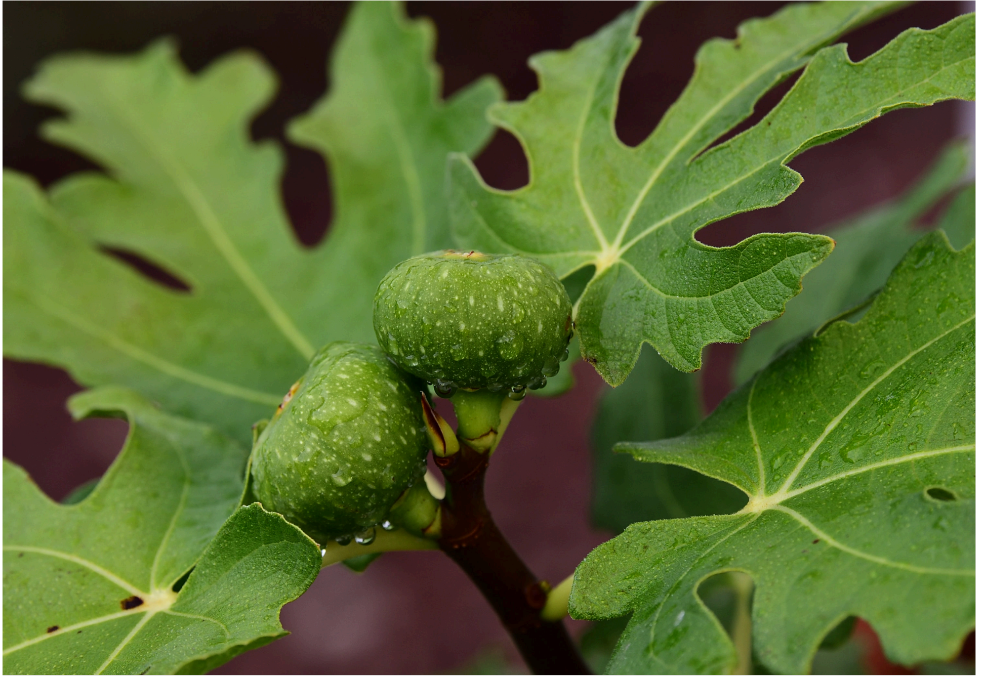
Figs in Rain.