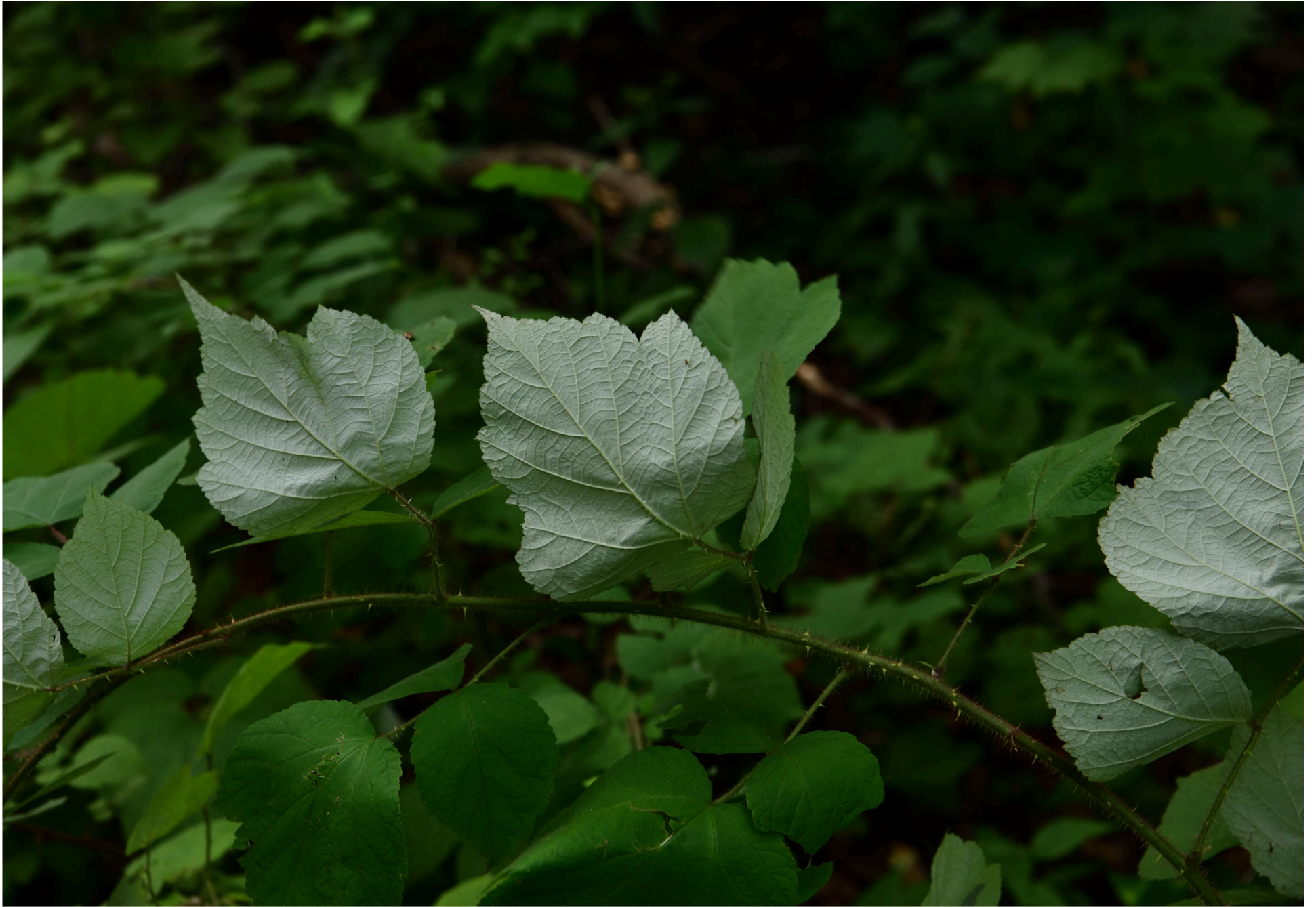
Wind Before the Storm.