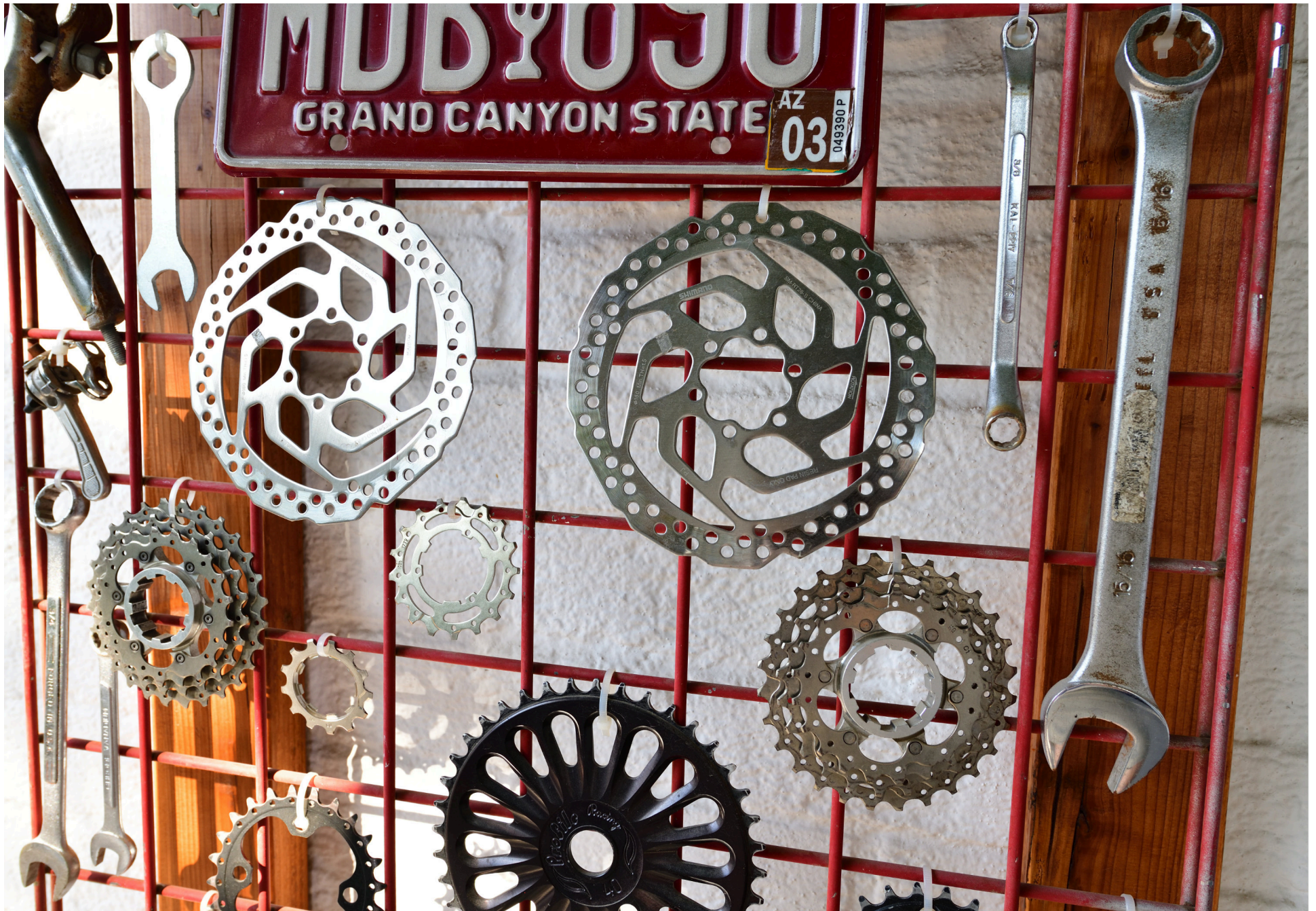
Found Object Collage.