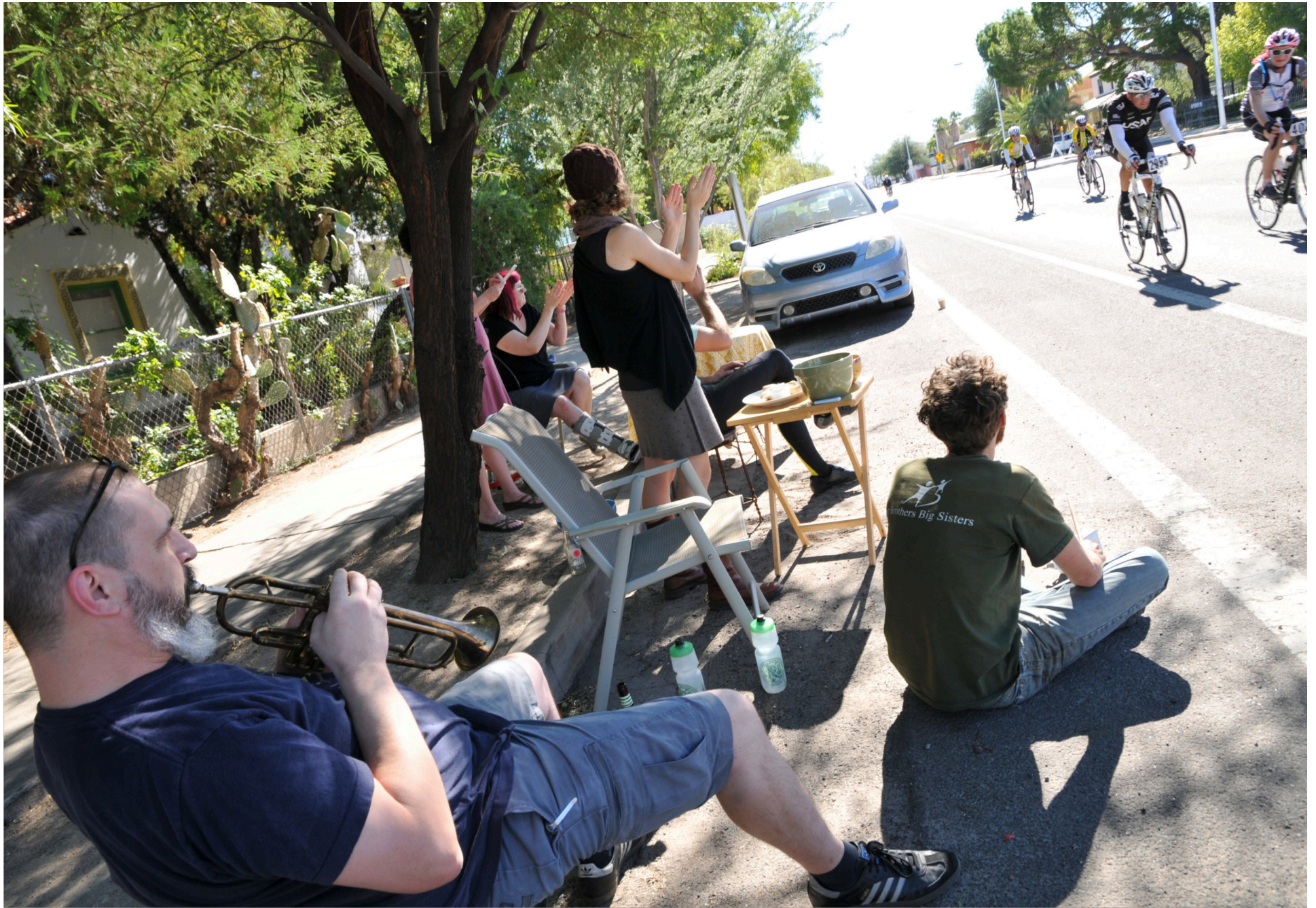
Armory Park Serenade.