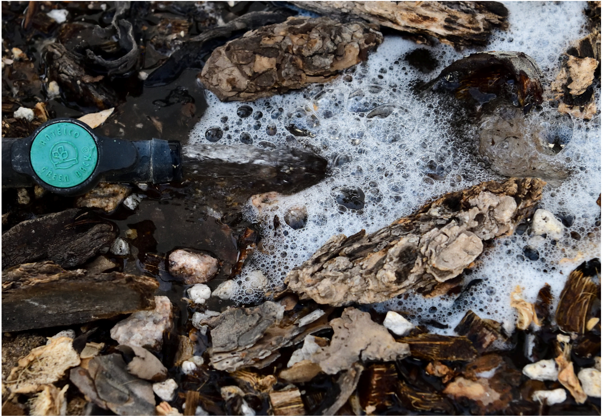
Greywater Emitter.