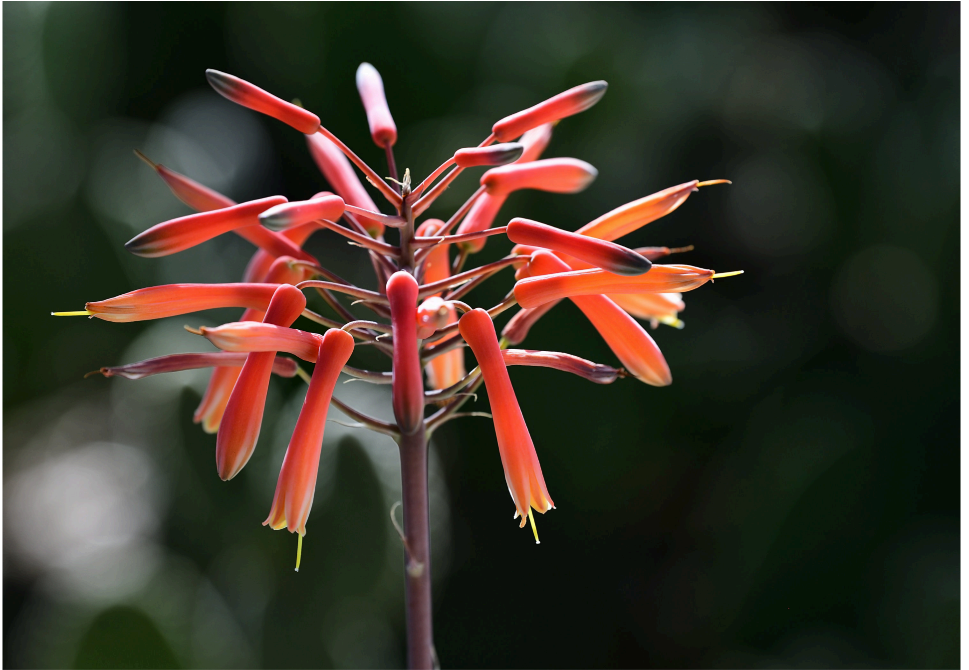
Blossoming Aloe Vera Flowers.