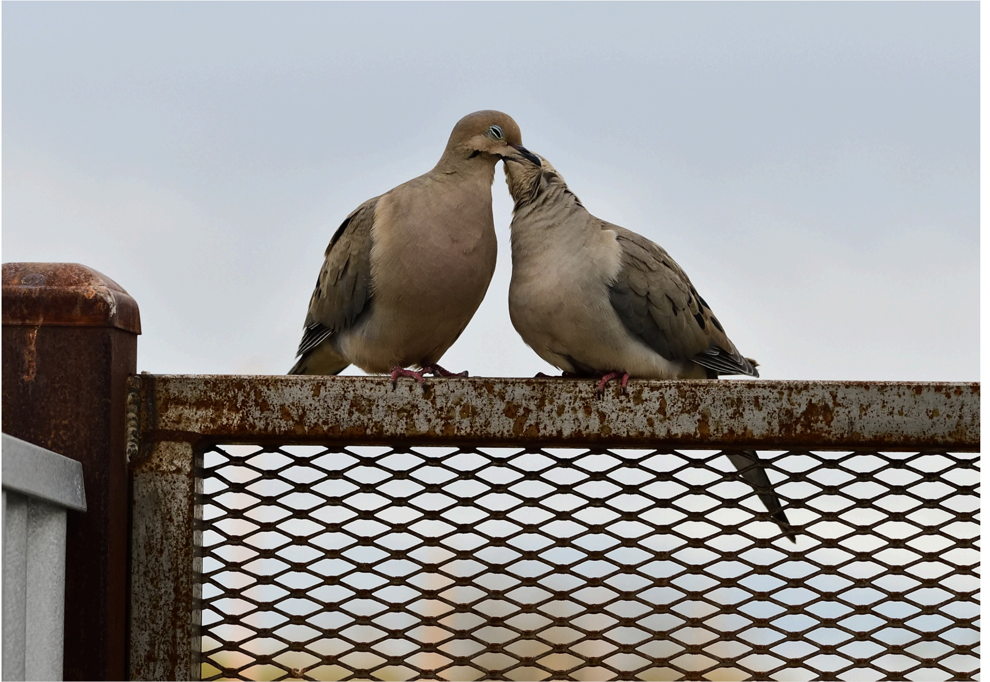
Lovey Doves.