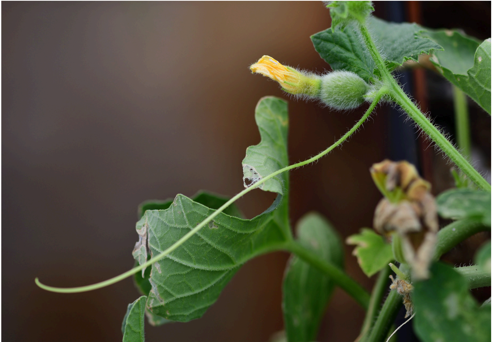
Super-Furry Cantaloupe.