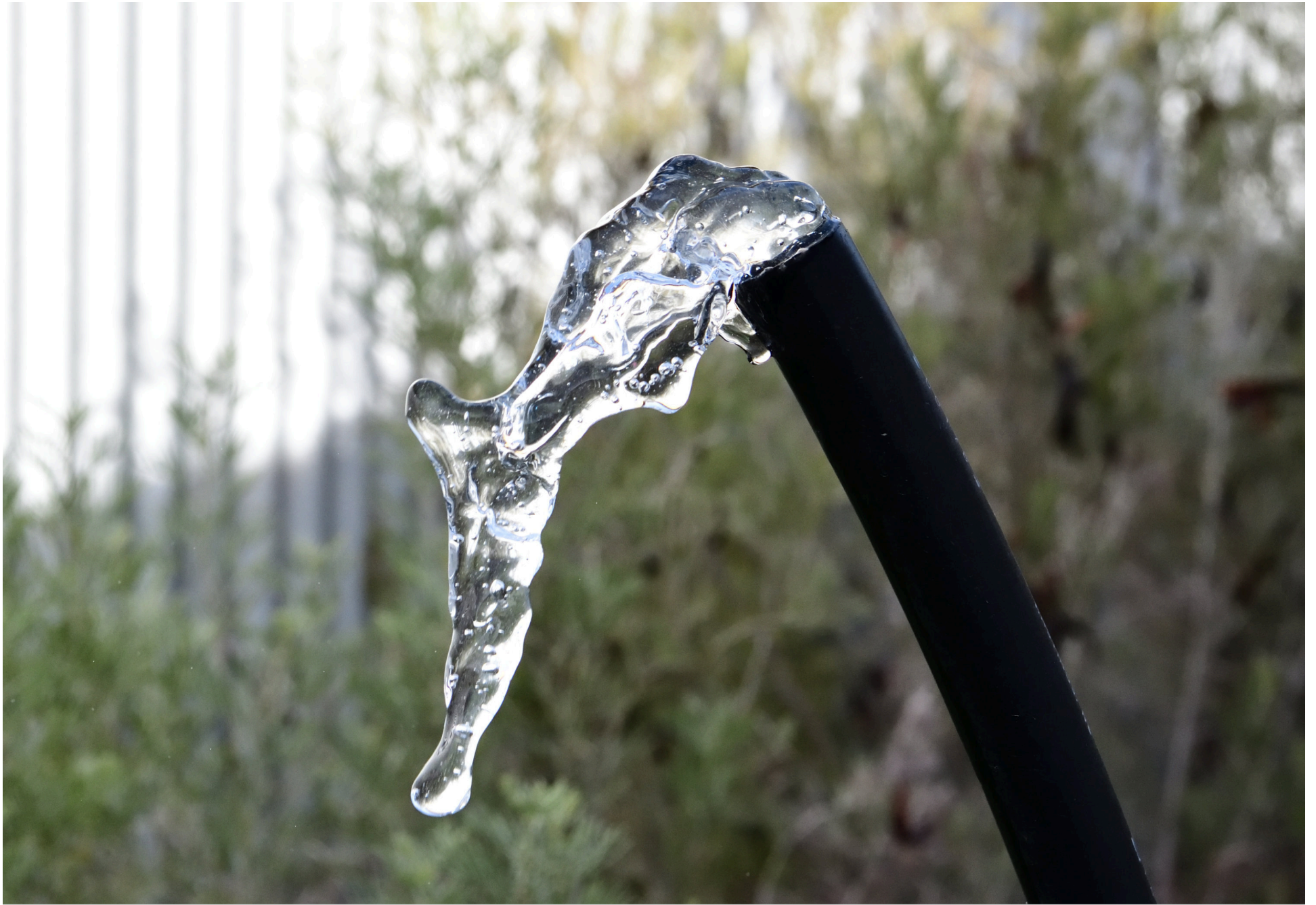
Greywater Overflow.