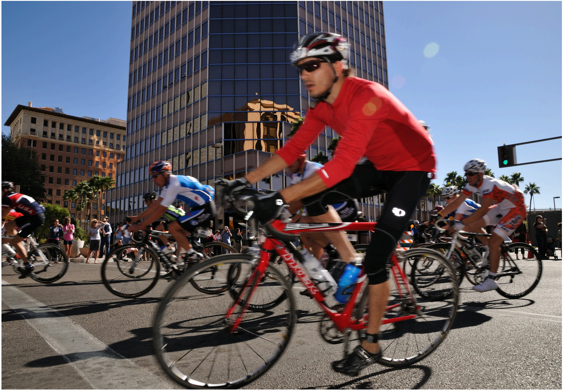
Final Sprint.